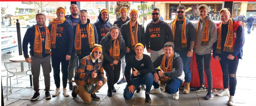
Above: Smart Tech Electrical who have been working on Hutt St Centre's re-development site supporting the builders Mossop are ready to start the annual Walk a Mile event.

View the report at www.adelaide.catholic.org.au/news-and-events/publications